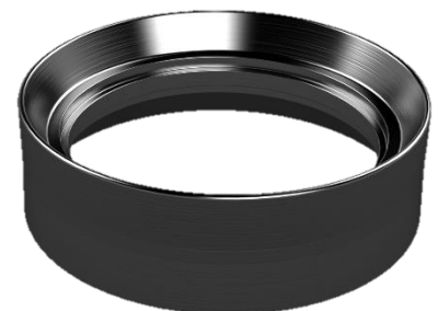
6 inch LX-7.5K, double lip