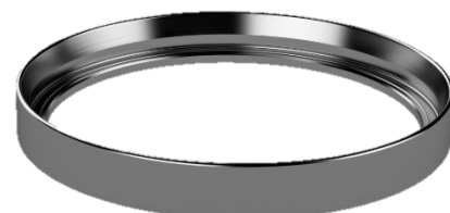
Ø150mm – 5K LX Single lip