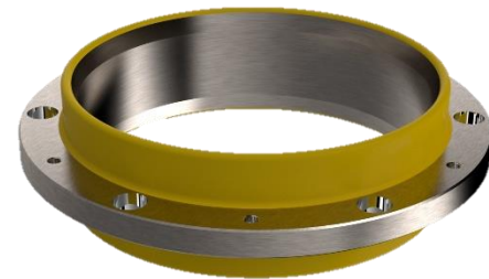
Ø180mm – 10K LX double lip